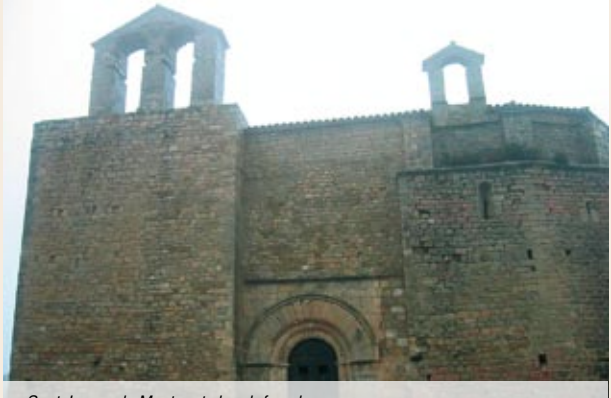
Sant Jaume de Montagut church façade

Esplanade. Various tracks leave from this point, basically intended for fire prevention purposes. We take the one which is by far the widest and most frequently used, following the wide mountain ridge through the not very dense forest.